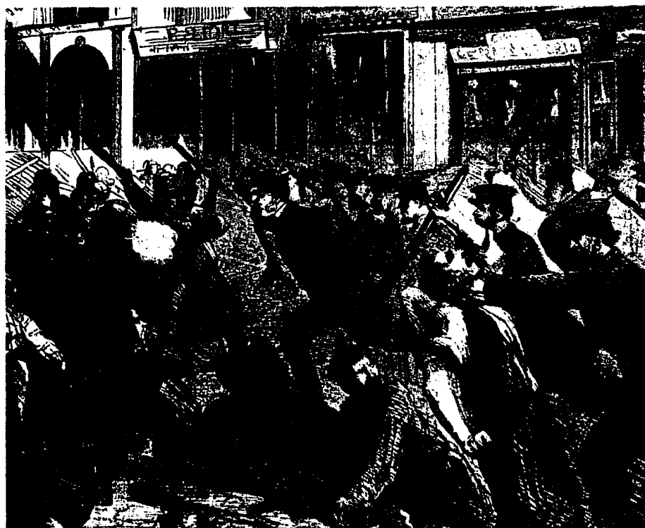
DRAFT RIOTS in New York City—from a wood engraving in The New York Illustrated News , Aug. 8, 1863. Conscription in the U. S. dates from the Civil War; peacetime conscription was introduced in 1940.

than it now costs to man them by compulsion—if cost is properly calculated. The cost listed in the Federal budget might be higher—though even that is not certain. But the real cost to the community would be far lower. The real cost of conscripting a soldier who would not voluntarily serve on present terms is not his pay and the cost of his keep. It is the amount of money for which he would be willing to serve. Compare, for example, the real cost to a star professional football player and to an unemployed worker. Both might have the same attitudes toward the army and like—or dislike—a military career equally. But because the one has so much better alternatives than the other, it would take a much higher sum to attract him. When he is forced to serve, we are in effect imposing on him a tax in kind equal in value to the difference between what it would take to attract him