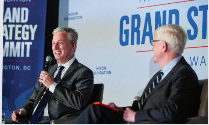
Former National Security Adviser and Nixon Foundation Chairman Robert C. O'Brien appeared in-conversation with Board Member and former Foundation President Hugh Hewitt.

In Beyond Peace , his tenth – and final – book, Richard Nixon laid out a blueprint for how the United States should approach the world in the post-Cold War era. His book offered what could be called a “grand strategy” for making the 21st century the second American century.