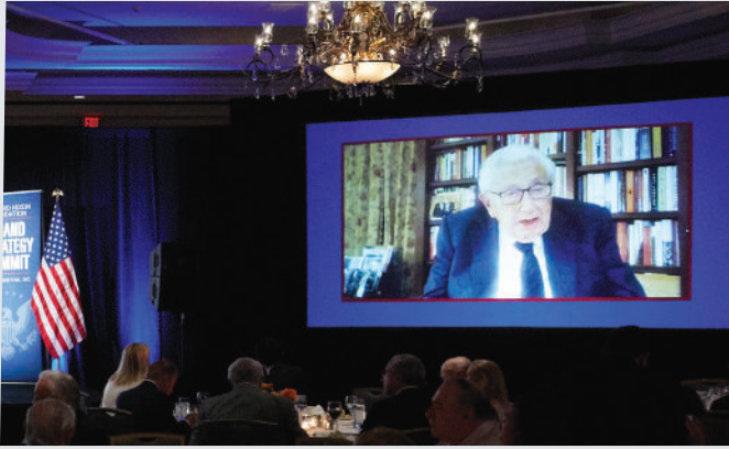
Opening remarks were delivered by former National Security Adviser and Secretary of State, Dr. Henry A. Kissinger.