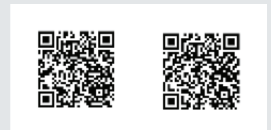
Scan QR code to watch Kissinger opening (left) and O’Brien and Hewitt remarks (right)

From China’s growing authoritarianism and its far-reaching espionage and intelligence gathering capabilities, to the danger of a nuclear Iran and Russia’s war in Ukraine, O’Brien asserted the need for a strong American military, and particularly an enhanced Navy, to deter America’s adversaries and the importance of putting America’s national interest first in the conduct of foreign policy.